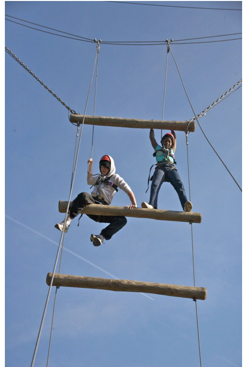
Excitement on the High Ropes

Sunday's Service was about the Holy Spirit – learning that we must trust that the Holy Spirit is with us wherever we go and whatever we are facing. Dorm Time for each of these evenings gave the young people in their smaller dorm-room groups to pray and discuss any ideas which had come from the Service.